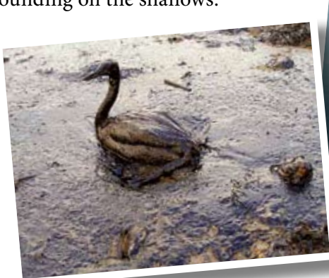
Killer whale, Oil tanker on fire, Bird soaked in oil

Once grounded in an ebbing tide, a tanker could easily break apart under its own weight and the force of the strong currents. Most large oil spills are the result of structural failures, something that rust-prone double hulls may make more likely.<sup>1</sup>